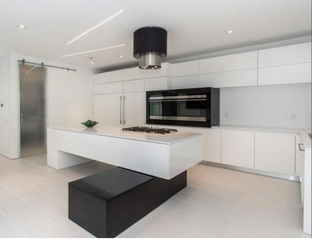
Custom Cleveland Area Kitchens